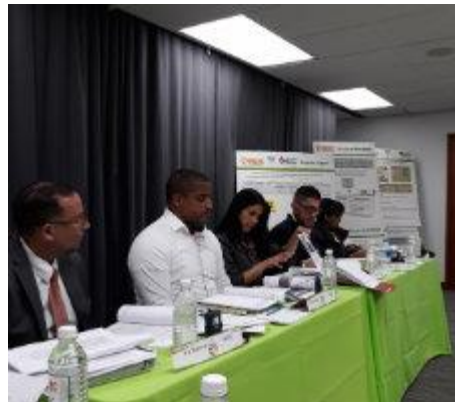
OCEAN, Inc. and First Bergen Federal Credit Union Partner to Bring Credit Union Services to Toms River, New Jersey